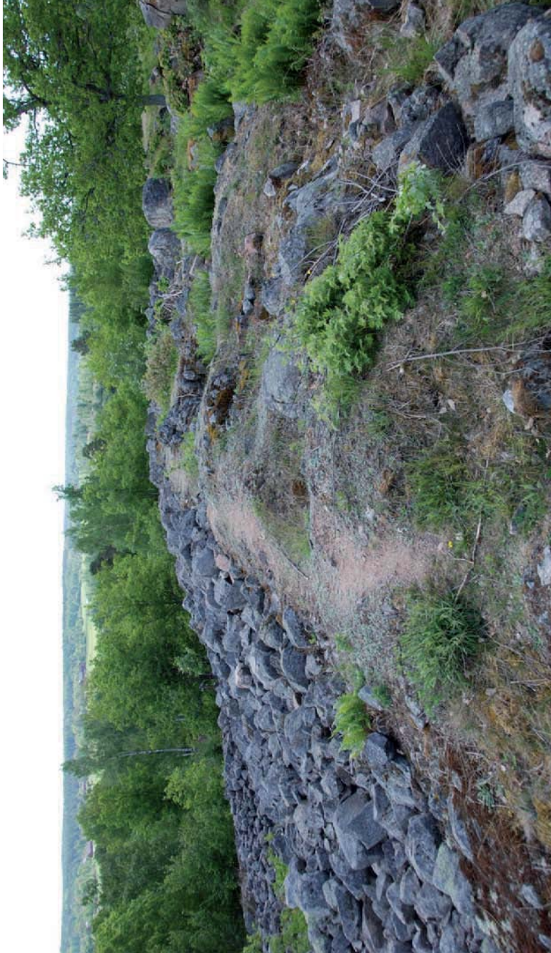
Figure 2: The Broborg hillfort outside Uppsala in Sweden showing the rampart consisting of stones joined by vitrified rock.